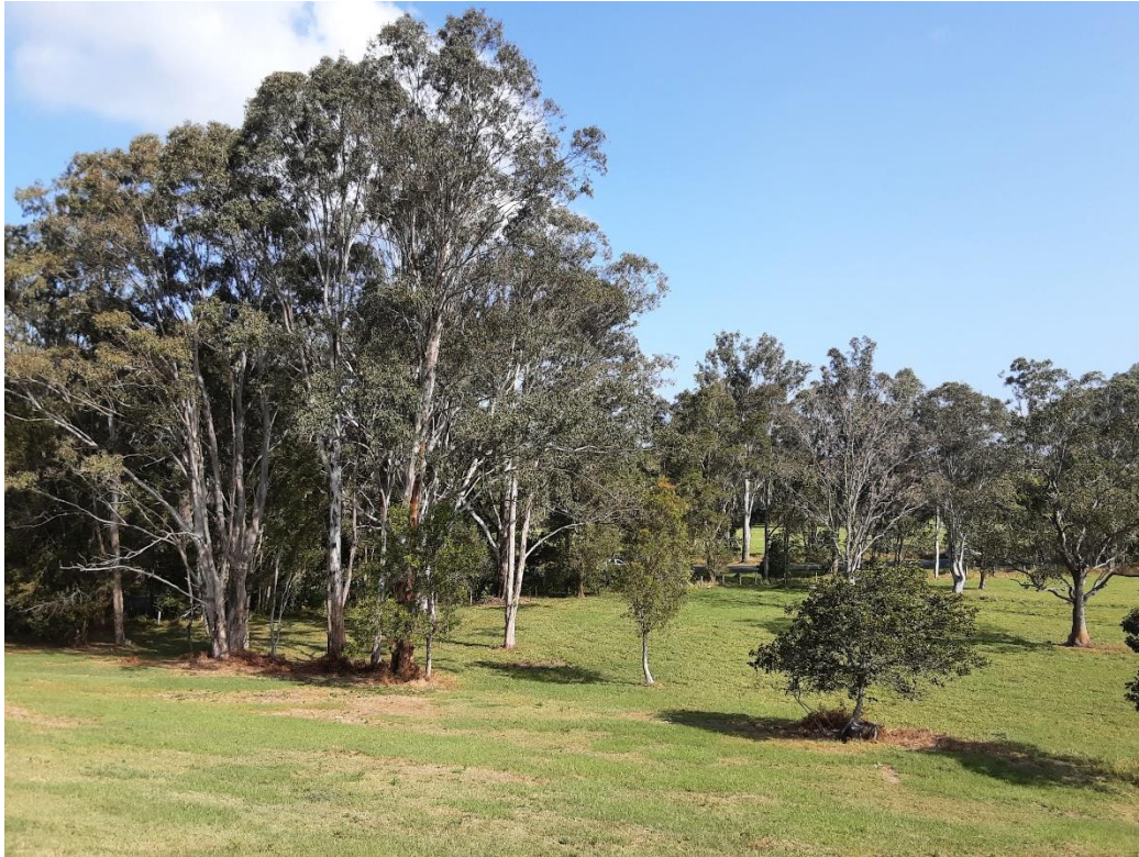
Figure 1: The Stand of Eucalyptus tereticornis (looking south-west in the area north-east of Precinct 3).