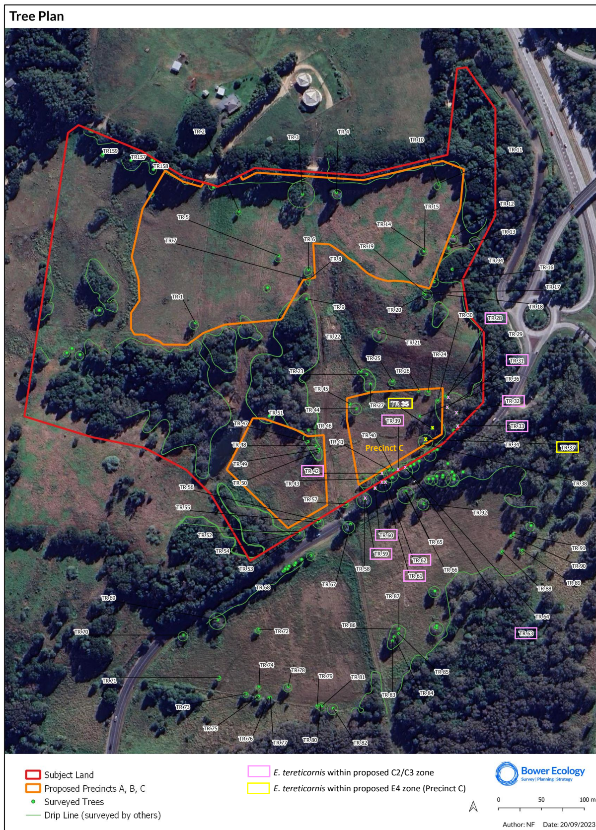
Figure 3: Tree Survey data, and the location of E. tereticornis in the stand of trees in the south-east.