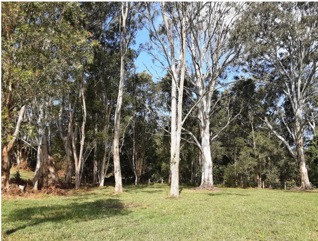
Figure 2: The Stand of Eucalyptus tereticornis (looking south-east from inside Precinct 3).